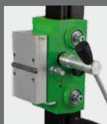
Universal tool holder